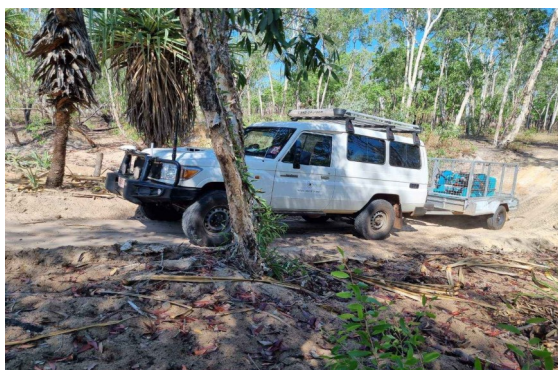
Crew travelling to site