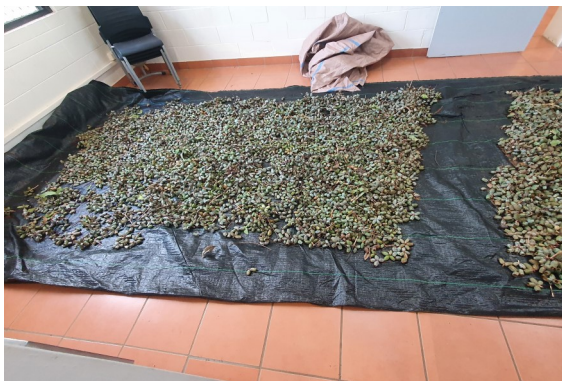
Seed stock being sorted