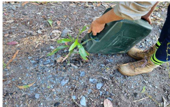
Watering of established tube stock plants