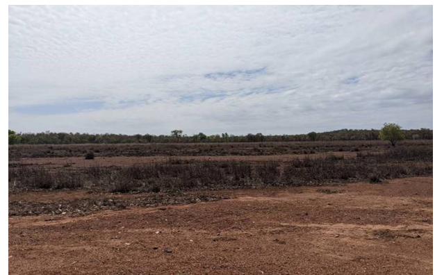
Site to be revegetated later in 2023

We are working with Batchelor Institute of Indigenous Tertiary Education to get the team ready to start their next qualification, Certificate 3 in Conservation Ecosystem Management.